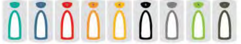
Pastel Green Pastel Blue Red Orange Yellow Black Dark Grey Lime Green† Brown (Cup Bank Only)