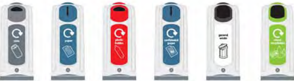
Grey Blue Red Blue Black Lime Green†