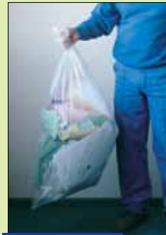
NOT Like This

The rectangular shape of the bin and sloped aperture allows over 3000 sheets of paper to fit neatly into Nexus 50.