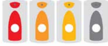
Red Orange Yellow Dark Grey