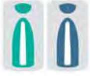
Pastel Green Pastel Blue